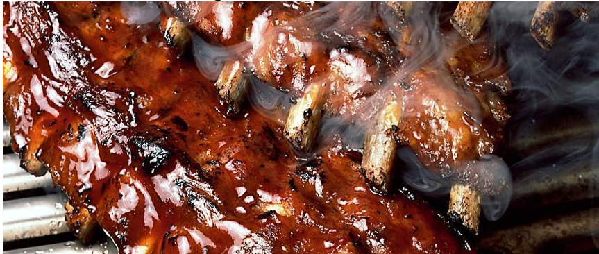
moose's smoked side ribs

A generous portion of lean, tender hickory-smoked pork ribs grilled to perfection with your choice of sauce Full Rack OR Half Rack