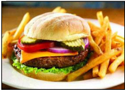
Backyard Burger with cheddar cheese

All burgers are served with shredded lettuce, tomato, pickle, onion and your choice of one Side Track.